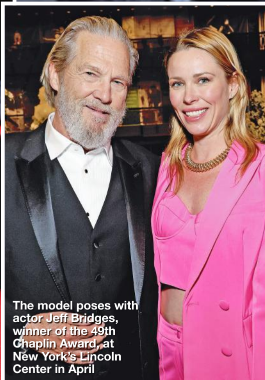
The model poses with actor Jeff Bridges, winner of the 49th Chaplin Award, at New York’s Lincoln Center in April